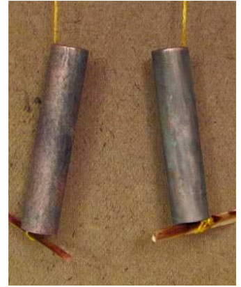
Dried rust remover wiped with a rag