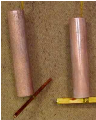
First coat of toilet bowl cleaner containing hydrochloric acid has been applied. Dried in about two days