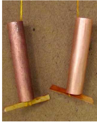
First coat of rust remover applied