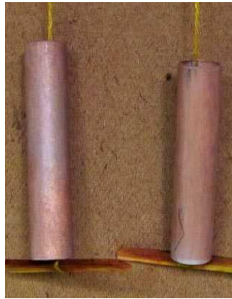
Second coat of toilet bowl cleaner dried. At this stage it doesn't look like much has happened but be patient, it gets better with time and weather