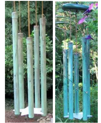
Left hand picture after about two months. Right hand picture after another coat of toilet bowl cleaner