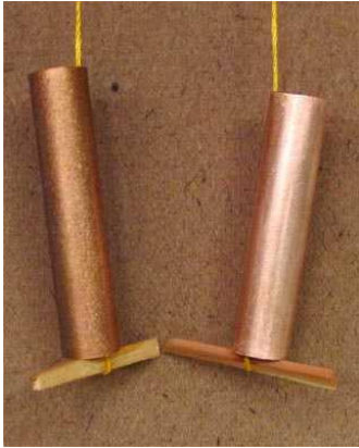
Cleaned and ready for the process. The tube on the left was sanded with 150 grit sand paper while the right hand tube was cleaned with steel wool

Time lapse for completing the patina process above.