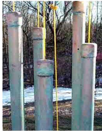
After a few weeks in the weather